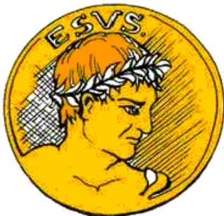
Iesus , the Son of Zeus (German-Celtic God)

Many would chastise me because I would tell you the truth. The greatest deception I can see ever laid upon man is the lie about our Savior's name. The Catholic translators who left out our great God (sic), Elohim's name YHWH (Yahweh) over 5,000 times, changed the name Yahshua to Jesus. Jesus comes from the Greek Iesus, a name that dates 1,000 B.C. representing the "Son of Zeus", and the Ur-Babylonian Eagle God.