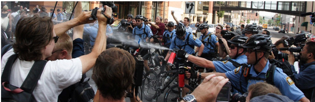
Bike cops pepper spray a crowd, including journalists.