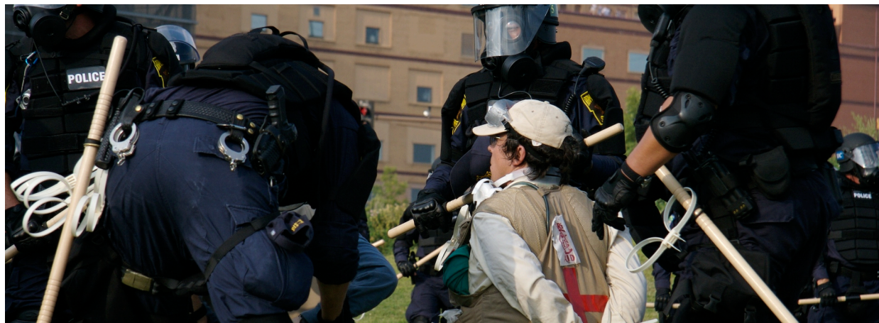
Medic arrested at RNC.

The CRASS Courtwatch Working Group has been hard at work attending court appearances and keeping track of everything happening to our comrades within the various courthouses.