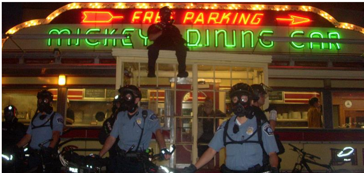
Riot Cops surround Mickey's Diner on day 2.