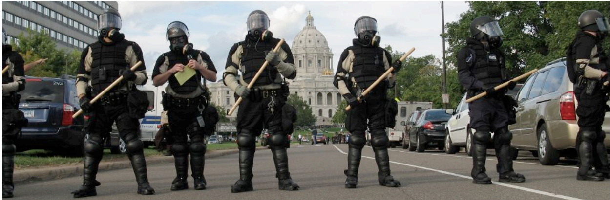
RNC Day 4.

Information and resources for the media from the Community RNC Arrestee Support Structure ( www.RNCaftermath.org )